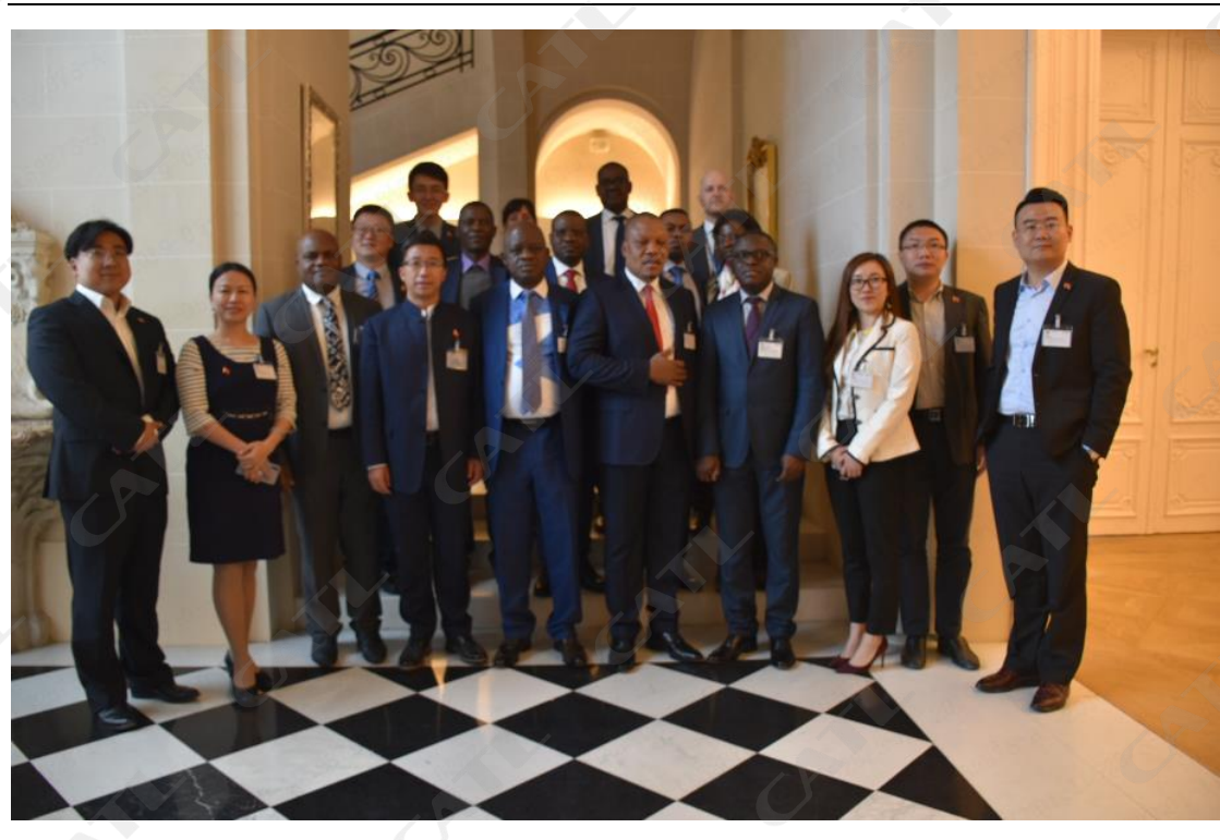
Figure 2 Photo by the Chinese delegation with representatives of the Congolese Ministry of Mines (CATL, right)

This report is a progress report on the cobalt supply chain, to improve the transparency and sustainability of the entire supply chain, CATL is also investigating and analyzing the supply chain of nickel, manganese, lithium, graphite through independent third party audit program. CATL plans to release progress status of other mineral supply chain in the next year's sustainability report.